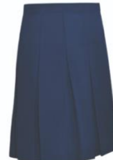
Girls Dominique Skirt $45 ★