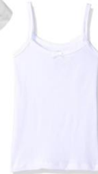
Girls undershirts $21.00 ★