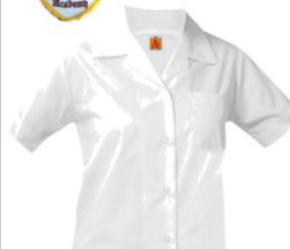
Girls Oxford Blouse $19.99 ★