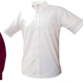
Boys Oxford shirt $22.00 ★