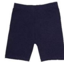
Girls Navy Modesty Shorts $9.99 ★

Items marked by a star are to be purchased thru the school store.