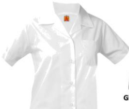
Girls Oxford Blouse $19.99 ★