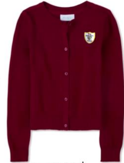
Girls Sweater $37 ★