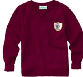
Pullover Sweater $37.00 ★