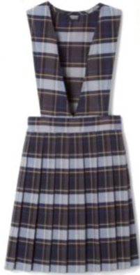
Girls Plaid Jumper