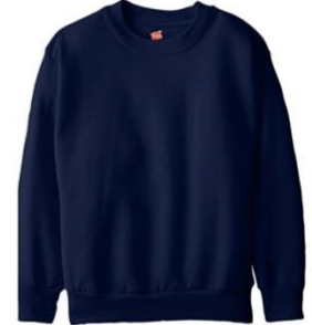
Recess Sweatshirt Navy Blue

Items marked by a star are to be purchased thru the school store.