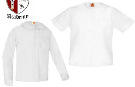
Girls Peter Pan Blouse $15.55 ★