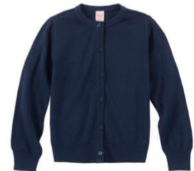
Navy blue recess sweater or sweatshirt

Items marked by a star are to be purchased thru the school store.