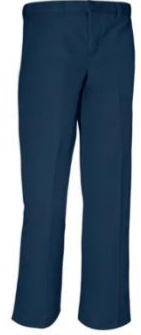
Navy Blue Pants $20.00 ★