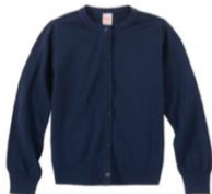
Navy blue recess sweater or sweatshirt