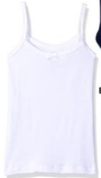
Girls undershirts $21.00 ★