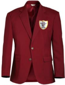
Men's Blazer $57.00/$67.00 ★