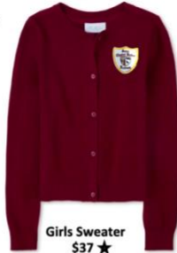
Girls Sweater $37 ★