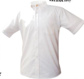
Boys Oxford shirt $22.00 ★