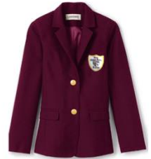
Girls Burgundy Blazer $57.00 /67.00★