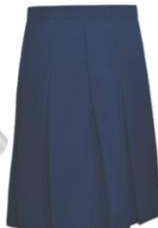
Girls Dominique Skirt $45 ★