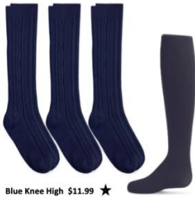
Blue Knee High $11.99 ★